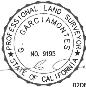
EXHIBIT "B" LM11-2023 PLAT MAP