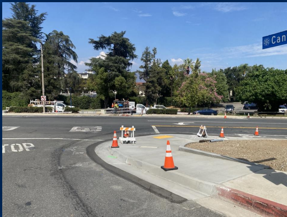
Photo of the new curb ramp and pole anchor bolts covered by barricades