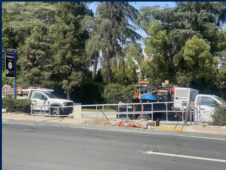
Installation of the pedestrian ramp and railing