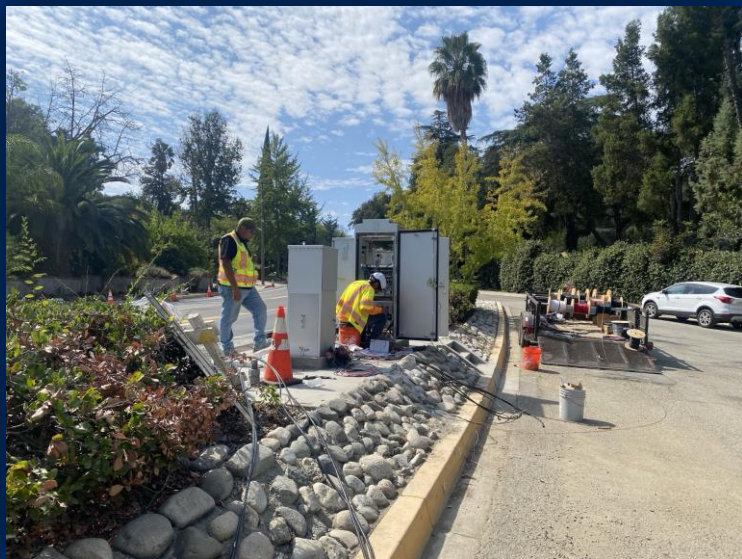
TS Cabinet installation with cable termination