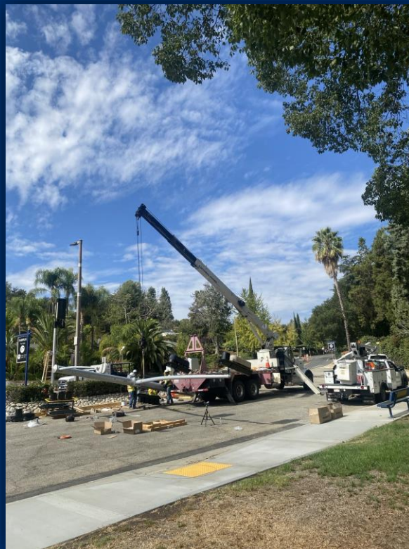
Crane with new galvanized traffic signal pole with mast arm