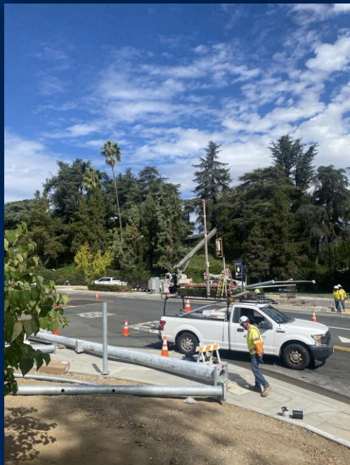
Prepping other traffic signal poles for installation