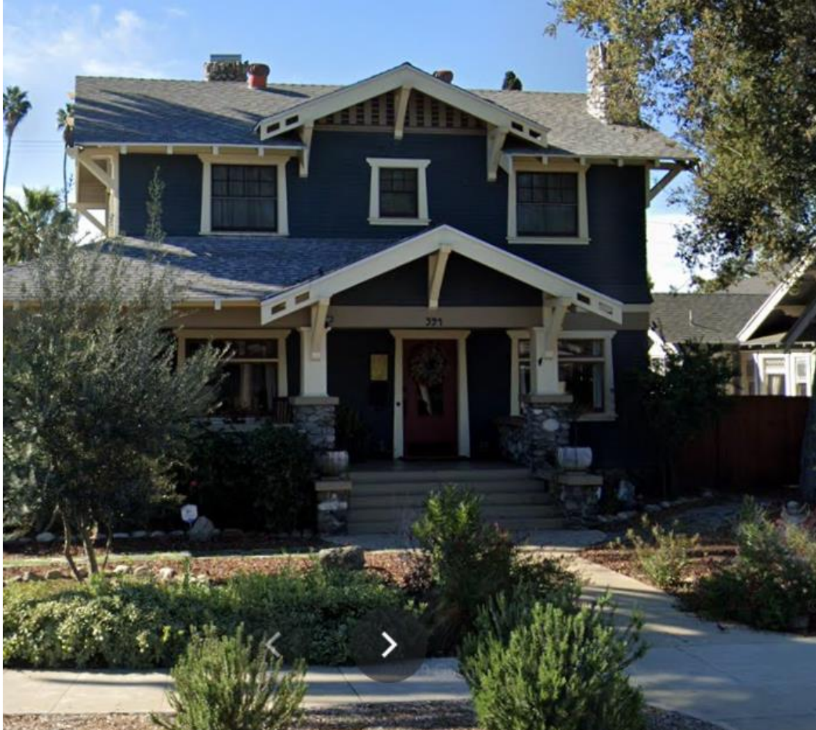
View of home from Colombia Avenue

Hinged Patio Door” on the north elevation, which faces the back yard. Manufacture information states that the door it is made out of wood protected by a vinyl exterior and the window is made of wood protected by fiberglass and Fibrex composite material. Pictures are shown below. Because the proposed window and door will not be visible from the street or alley, staff believes that there is flexibility in allowing it as it is same in “appearance” although it is not the exact material.