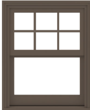
A-Series Double Hung Window

Links to these manufacturing details can be accessed here: