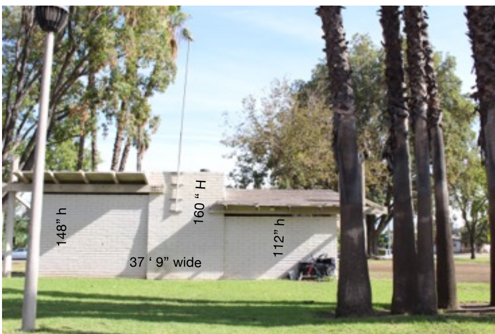
Image : South facing side of the restroom.

Southside - East side back id 112" H, Mid back is 160"" and the west side back is 148"