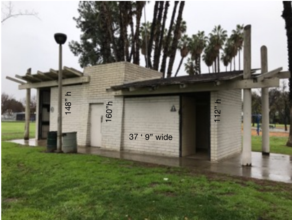
Image : North facing side of the restroom.