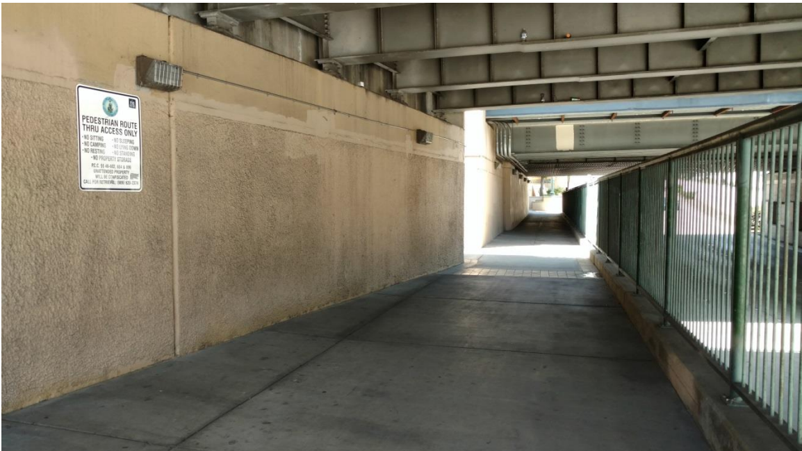
Pedestrian path along the west side of the Underpass