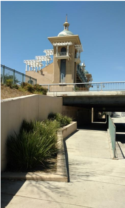
East side of the underpass looking north from the pedestrian level