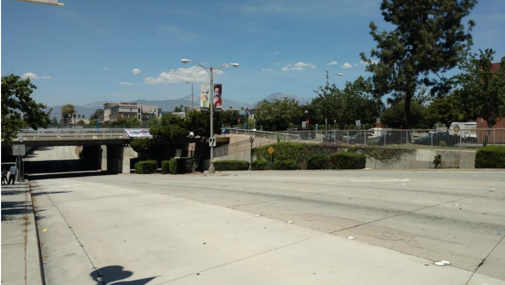
From Second Avenue looking north at the Underpass