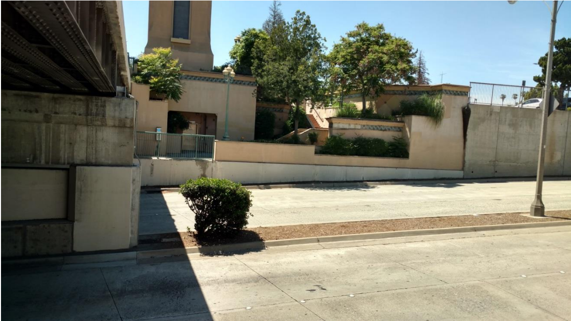
From the pedestrian path on the west side of the Underpass looking east