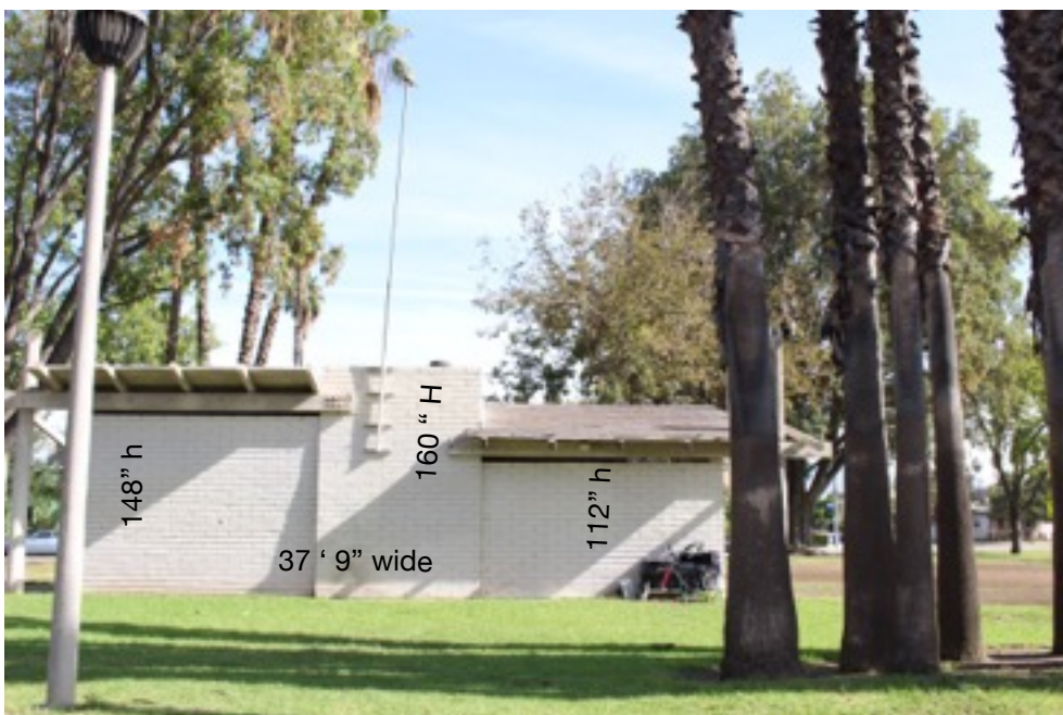
Image : South facing side of the restroom.

Southside - East side back id 112" H, Mid back is 160"" and the west side back is 148"