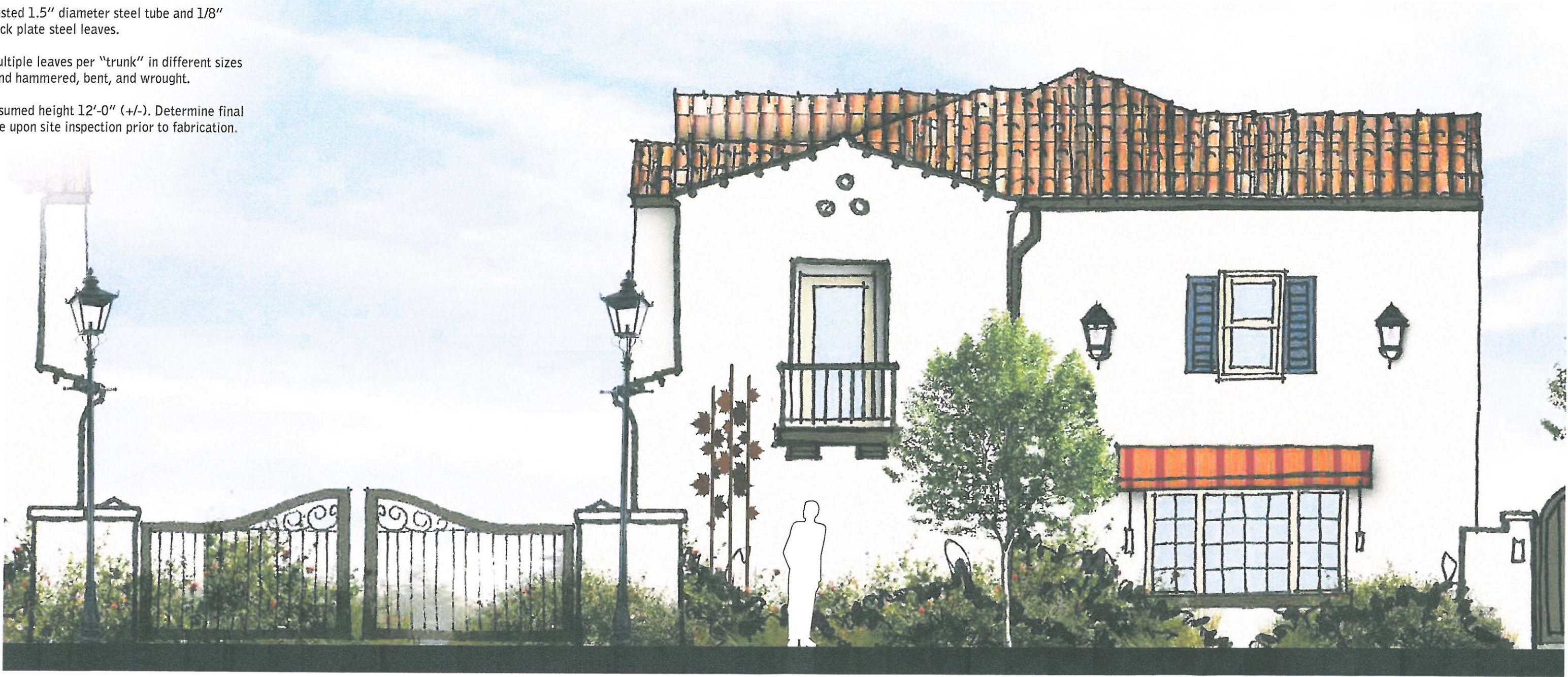
1 WEST ELEVATION (WHITE AVENUE): Sculpture scale: 1/4" = 1'-0"

Assumed height 12'-0" (+/-). Determine final size upon site inspection prior to fabrication.