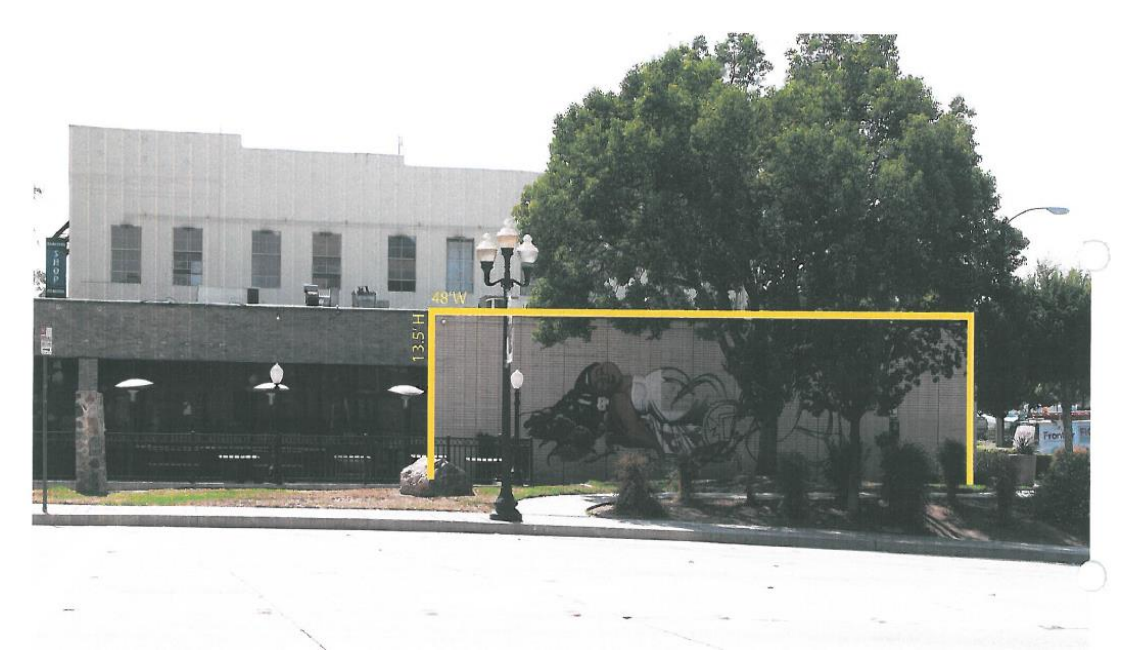
View looking west from Garey Avenue

Inspiration for proposed mural depicted below: