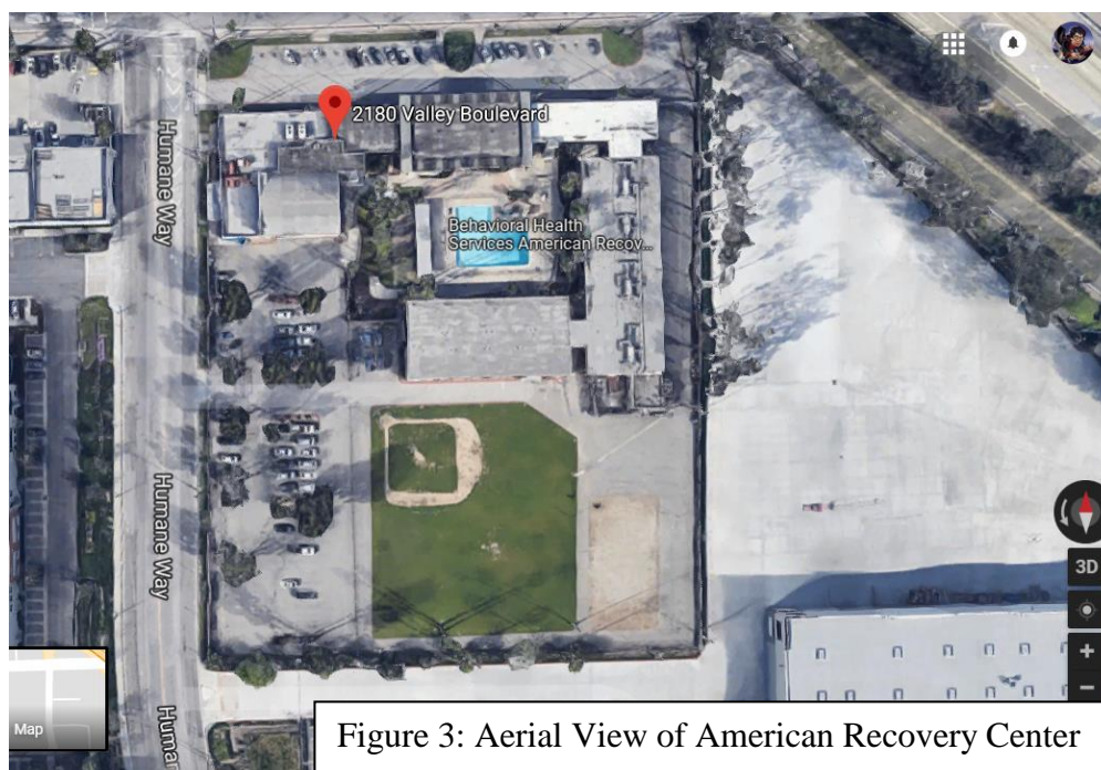
Figure 3: Aerial View of American Recovery Center

Behavior Health Services’ American Recovery Center located at 2180 West Valley Boulevard, Pomona, is a Residential Substance Abuse Treatment facility (Figure 3- below). The Center sits on a large property of 3.82 acres with vacant and underutilized land. Given the existing use, it would be appropriate to incorporate an emergency shelter component on site.