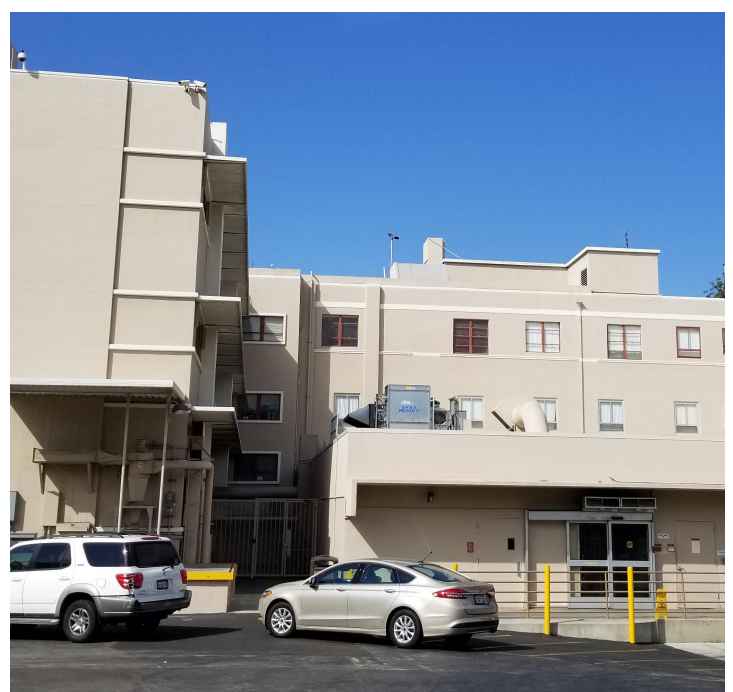
3) Existing condition, looking toward the building from outside of the gate