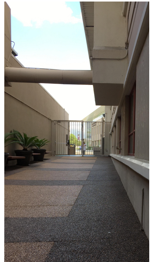
1) Existing condition looking toward the gate, away from building