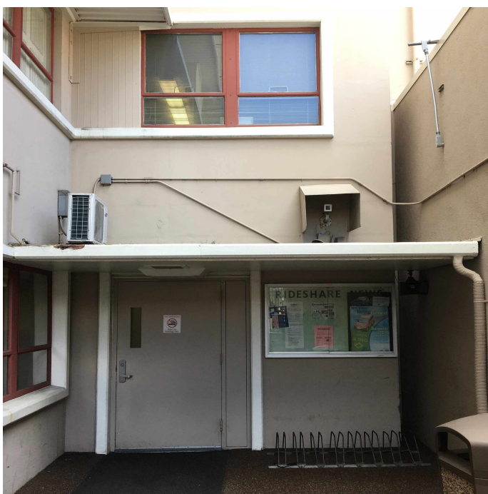
2) Existing condition, looking toward the building