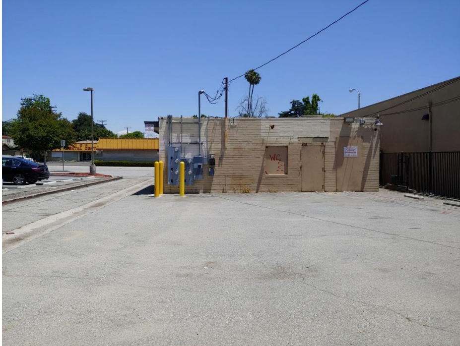
Rear elevation and parking spaces