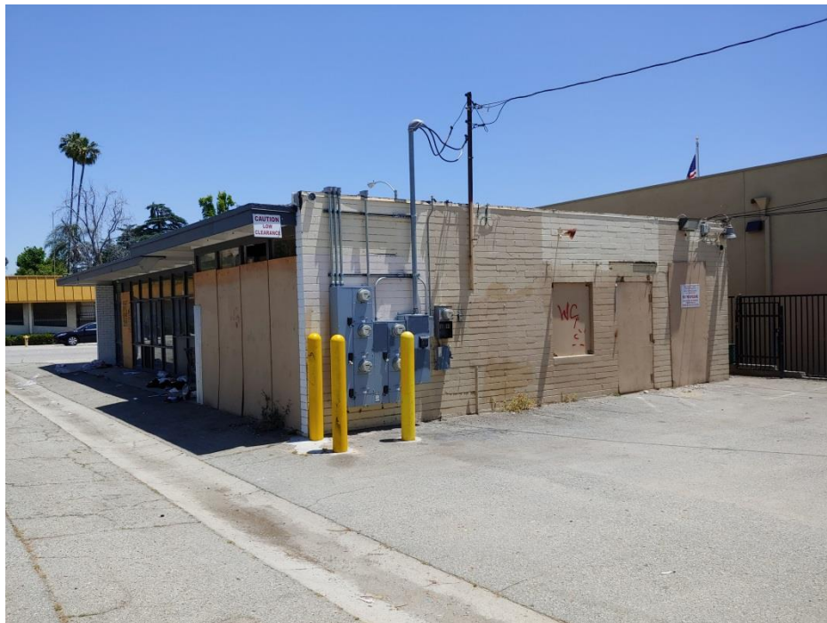
Rear elevation of subject site