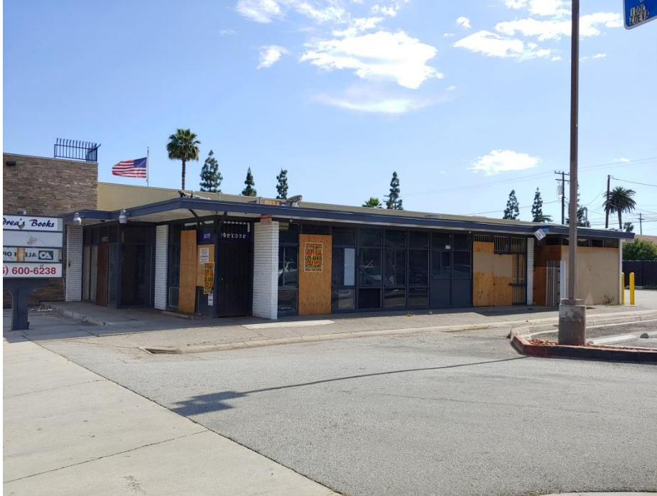
Southwest view of subject site