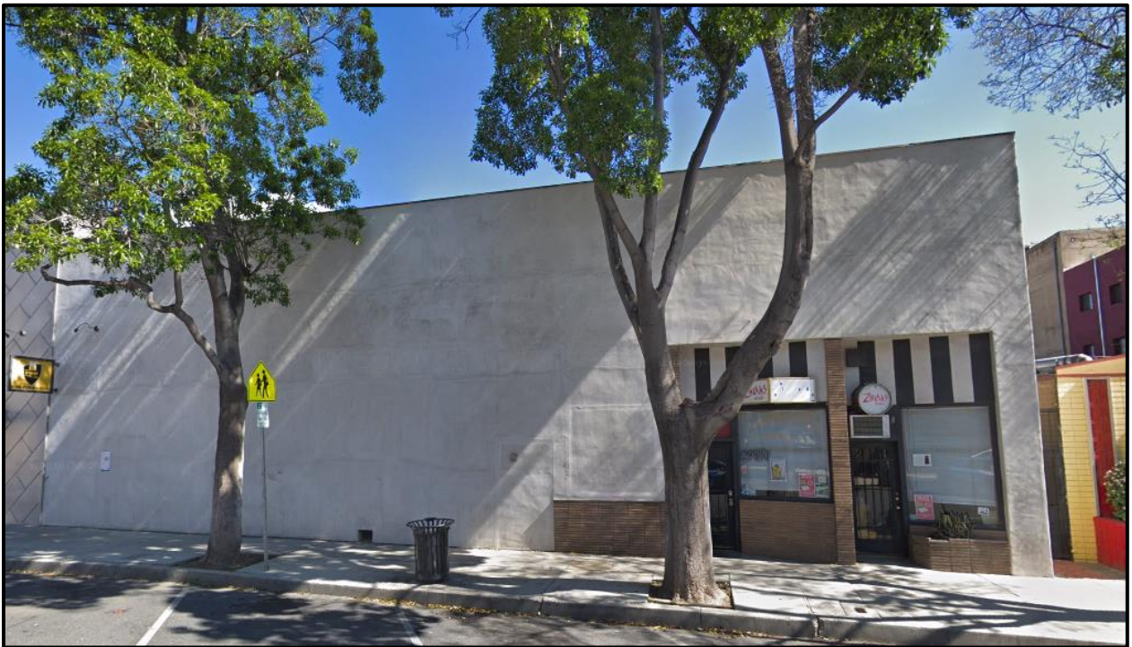
Approximate Wall Dimensions

The mural will be located on the western wall of the structure from the sidewalk continuing to the top of the structure. The total area of the western wall is approximately 1,500 square feet. The subject wall is painted stucco and includes a storefront. The mural will not incorporate the existing storefront.