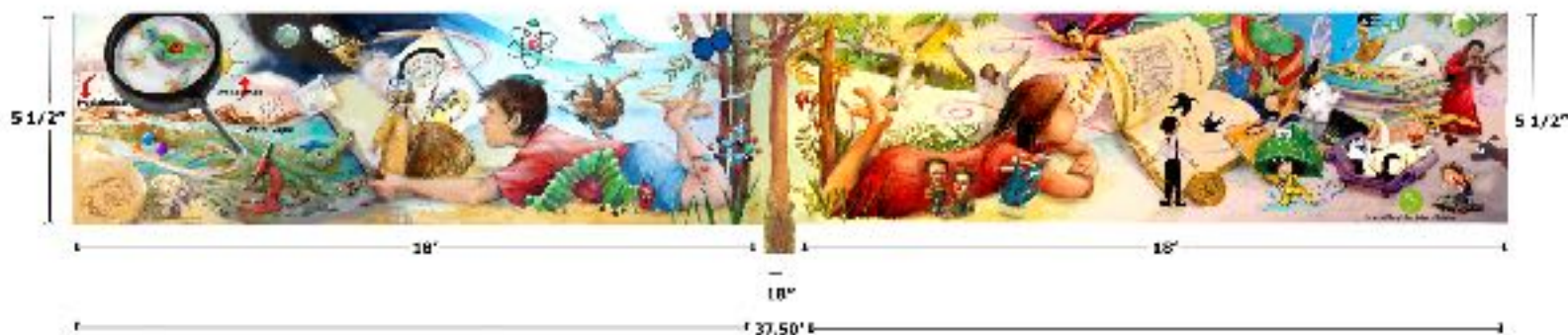
Wall to Wall

My goal is to transform the blank west wall in the Pomona library children's room to robust and vibrant visual inspiration that engages and sparks a desire to explore and learn the many wonderful subjects that live in the pages of the books housed in Pomona's epic Welton Beckett masterpiece.