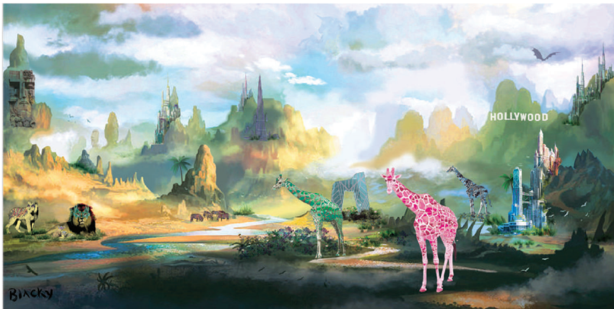
Shangri-La La Land , Mixed-Media Mural 20 Feet Wide x 9 Feet in Height • West Hollywood, CA.