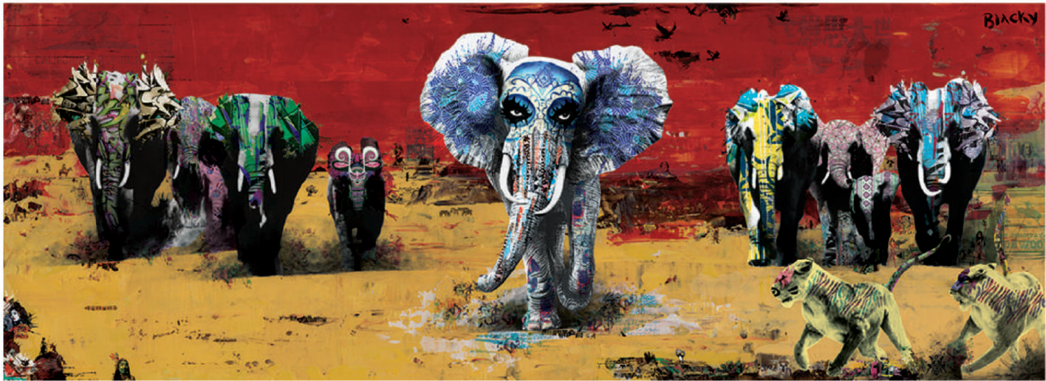
CHARGE! , Mixed-Media Mural 40 Feet Wide x 15 Feet in Height • Los Angeles. CA