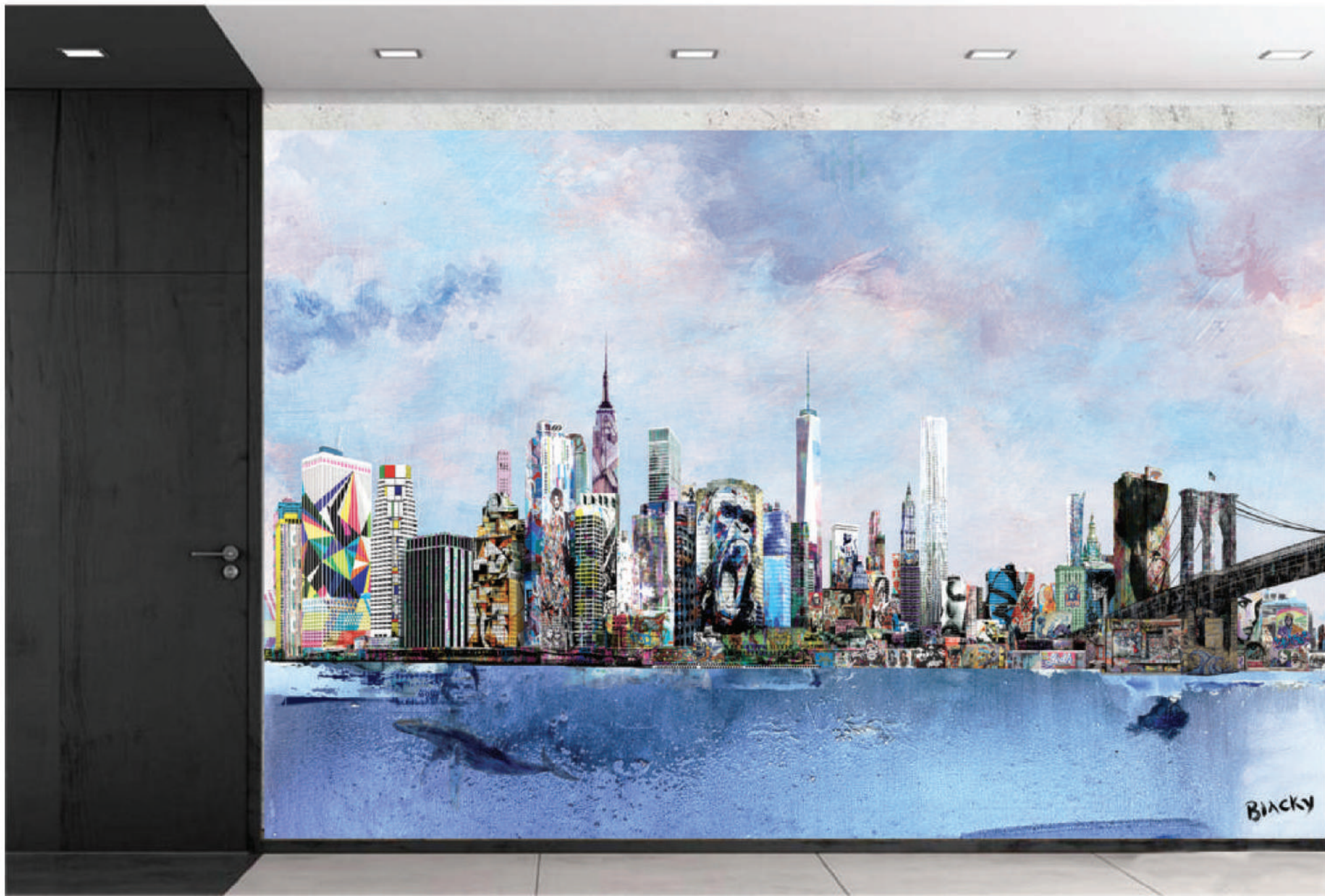
EMPIRE , Mixed-Media Mural 12 Feet Wide x 8 Feet in Height • Brooklyn, NY.